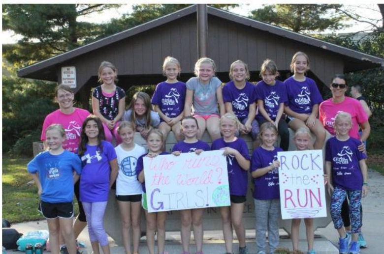
Waverly Girls on the Run team raced at the Girls on the Run 5K that was hosted by the Waverly FCCLA Chapter.