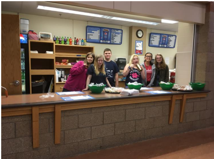
The Lincoln Southwest FCCLA Chapter hosted a craft fair that provided donations for 32 LSW students and their families.