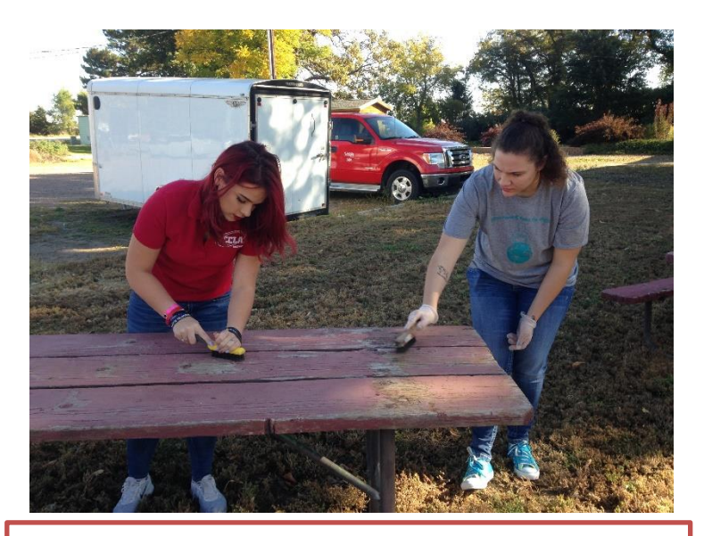
Maxwell FCCLA members scraped paint off tables at the West Central Research Extension Center as part of the service work that chapters members participated in during District Leadership Conference.